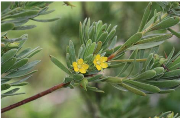
Figure 11. Bay cedar branch

Bay cedar can be used as a hedge, as it responds well to clipping, or as a specimen or border plant in beach locations. It also can be planted in a container or used as a screen when planted in a row with trunks five to six feet apart (Gilman 2007). Bay cedar is a good nectar source. Lantana, Spanish needles, and fogfruit also make great nectar sources for a variety of butterflies.