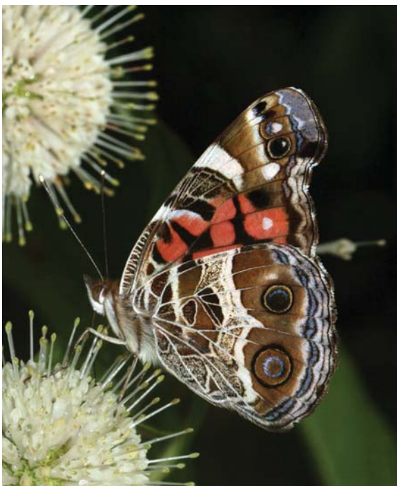
Figure 7. American lady

Many undeveloped areas have cudweed or fogfruit growing in them. Figures 6, 7, 8, and 9 show these host plants and their associated butterflies. Larvae of the American lady shelter themselves in the puffy blooms of cudweed. Search for larvae in the flower heads in the springtime.