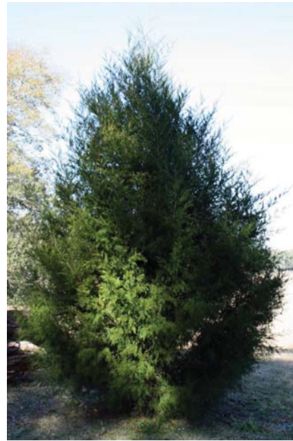
Figure 4. Red cedar

Table 6 lists suggestions for host plants for each layer of plantings in dry retention areas.