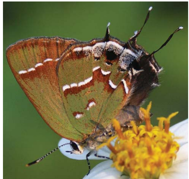
Figure 5. Sweadner's juniper hairstreak