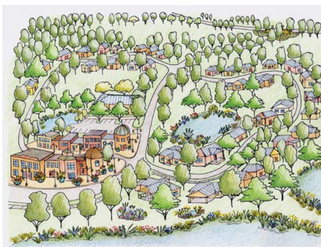
Figure 1. Community ButterflyScaping expands the concept of butterfly gardening through community-wide preservation and planting of butterfly host vegetation. (Illustration: Gail Hansen)

Community Butterflyscapes encompass all butterfly-attracting vegetation—from canopy trees to