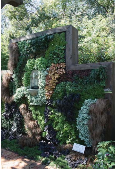
Figure 15. Example of a green wall presented at EPCOT

By planting host plants in vertical green walls—upright garden structures that contain soil and sometimes watering systems for plants—communities can attract butterflies and feature their host plants in a unique way. Figure 15 is an example of a green wall.