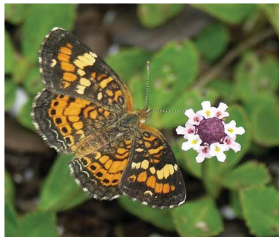
Figure 8. Fogfruit with phaon crescent

To propagate fogfruit, find a succulent, healthy stem with several leaves. Near the bottom of the stem, trim at least two leaves at the leaf nodes. Place the exposed nodes in wet, rich soil or water. The nodes will form roots. Water daily for at least a week until the plant no longer wilts between waterings. While fogfruit can grow almost anywhere, from beach dunes to pond edges, it makes a lush, dense groundcover under moist, rich conditions. It hosts the phaon crescent, white peacock (South Florida), and common buckeye.