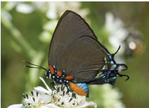
Figure 2. Great purple hairstreak.

Note: North Florida roughly means the Panhandle to Central Florida. South Florida roughly means from Central Florida to South Florida. For specific zones, see UF/IFAS document, Butterfly Gardening in Florida , http://edis.ifas.ufl.edu/UW057 . Mistletoe, host for great purple hairstreak (North Florida), grows on oaks. Figures 2 and 3 show the butterfly and its host plant.