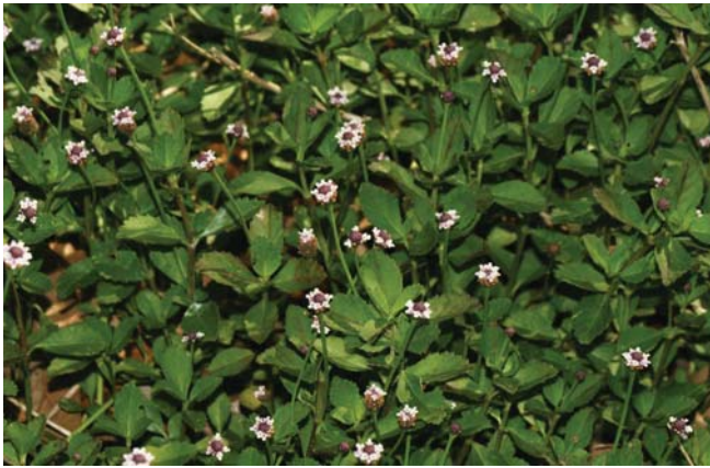
Figure 9. Carpet of fogfruit