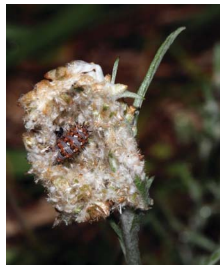
Figure 6. American lady larva in a cudweed flower head

By designating areas that are not mowed frequently, residents can see which of the more obscure, weedy host wildflowers draw in butterflies. With a Community Butterfly Scape as the context, plants that might otherwise be unwanted or overlooked have a purpose. It may be surprising and rewarding to see which plants emerge in these areas of interest and the butterflies that find them.