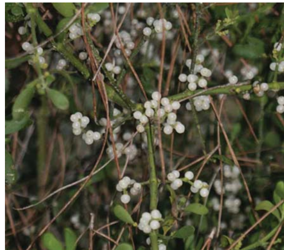
Figure 3. Mistletoe, a native plant, is parasitic in oak trees. Mistletoe is the host for the great purple hairstreak, which ranges from North Central Florida through the Panhandle.