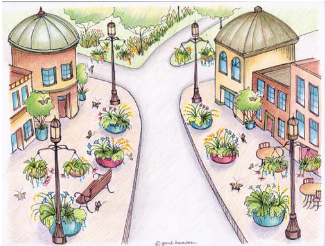
Figure 13. Butterfly bouquets: Larval host trees and plants, with nectar accents, in hanging baskets and containers add interest along the sidewalk of a town center. (Illustration: Gail Hansen)

fritillary, black swallowtail, giant swallowtail, phaon crescent, common buckeye, and white peacock (South Florida). Place a small sign in the container that mentions the bouquets are part of the Community ButterflyScape and identify the plants and butterflies that use them. Table 9 contains additional examples of plant combinations.