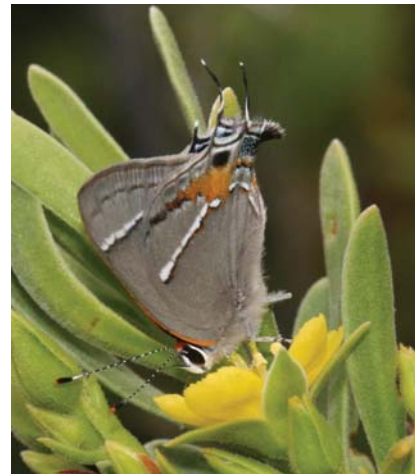
Figure 12. Martial scrub-hairstreak

Bay cedar can be used as a hedge, as it responds well to clipping, or as a specimen or border plant in beach locations. It also can be planted in a container or used as a screen when planted in a row with trunks five to six feet apart (Gilman 2007). Bay cedar is a good nectar source. Lantana, Spanish needles, and fogfruit also make great nectar sources for a variety of butterflies.