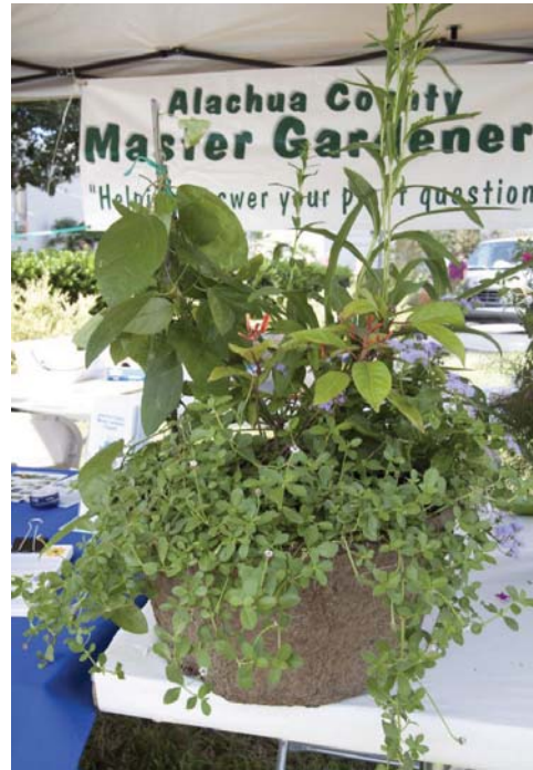
Figure 14. Example butterfly bouquet